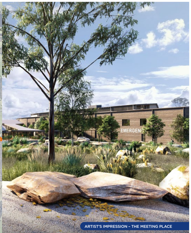
ARTIST'S IMPRESSION - THE MEETING PLACE