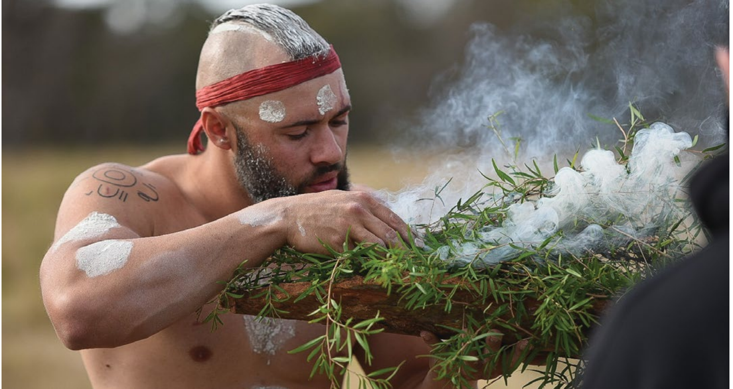
Muladha Gamara Cultural Dancers perform at the ceremonial land cleansing ceremony on the site of the new hospital