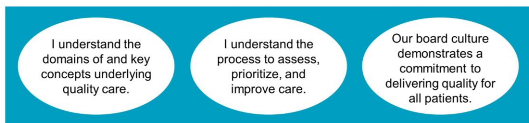
Figure 1. Vision of Effective Board Governance of Health System Quality

IHI worked with the expert group to establish an aspirational vision for trustees: With the ideal education in and knowledge of quality concepts, every trustee will be able to respond to three statements in the affirmative (see Figure 1).