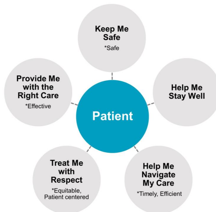
Figure 3. Core Components of Quality from the Patient’s Perspective

*IOM STEEEP dimensions of quality: Safe, Timely, Effective, Efficient, Equitable, and Patient centered